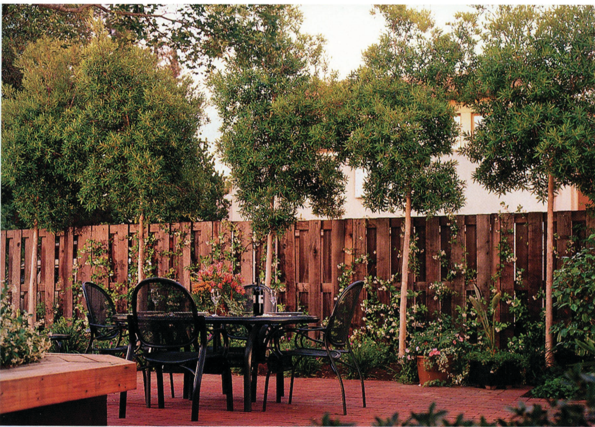
Board fences may be common, but they don't all need to look the same. The good-neighbor fence above alternates boards, making it equally good-looking on both sides. Fast-growing trees, 5 feet apart, offer extra privacy only two years after being planted. At right, fluted joints and a "piano-key" top section add a touch of openness to a green-painted Craftsman fence. Below, rustic grapestakes fill in between more formal brick pilasters.

Building techniques Tools and materials Design ideas