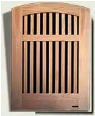
E-2 EAST GATE : #88