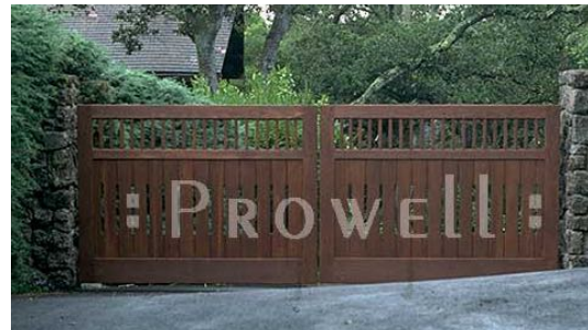
E-4 AUTO GATE #2