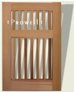
E-3 PEDESTRIAN #40